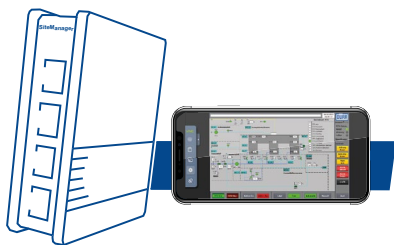
SiteManager, Remote Access App